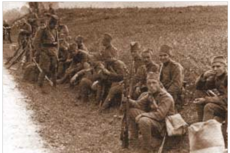
Slovenian soldiers during manoeuvres, wearing the uniforms of the Royal Yugoslav Army.

Faced with resistance, the German, Italian and Hungarian occupying forces resorted to extreme terror. Partisans caught were not treated as prisoners of war, hostages were taken and shot; civilians were deported to concentration camps in large numbers. Aided by the Roman-Catholic Church in Slovenia, in summer 1942 Italians organised local quisling units known as MVAC (anti-Communist militia). Following the capitulation of Italy, in autumn 1943 the German occupying forces formed anti-Resistance units called “Slovenian homeguards (militiamen)”. These quislings swore to fight under the command of Hitler against partisans and their allies.