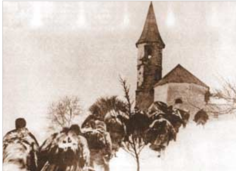
The elite, well-armed 14 th Division of the National Liberation Army – which included partisan detachments – undertook the first major manoeuvring march of the Slovenian Army during World war II.

signed at Brioni on July 7, 1991 – on the initiative of European negotiators – whereby the Slovenian independence act was postponed for three months, but in the meantime the national defence forces remained in control of the whole Slovenian territory. The Yugoslav units were blocked in barracks and, under the circumstances, the Yugoslav presidency decided to have the army move out of Slovenia. The last Yugoslav soldier left Slovenia during the night from the 25 th to the 26 th October of 1991.