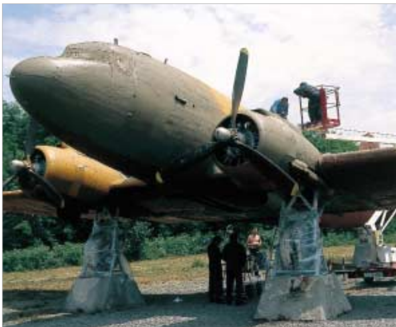
C-47 Dakota – “plane museum” photographed at Otok in the Bela Krajina region. It is kept there to commemorate the co-operation of the Partisan Army with the Allies. During World war II. Slovenian partisans rescued 305 American and several dozen British airmen.