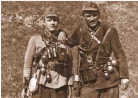
Slovenian partisans during World war II.

gin with, they deported intelligentsia, teachers and priests.