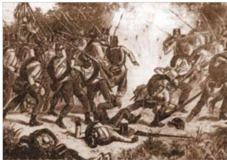
Soldiers of the 47th Slovenian-Styrian infantry regiment in battle near Costuzza on July 25, 1848.

From 1820 to 1866 Slovenian regiments made part of the Austrian occupation army in Italy. They also took part in wars fought against Italy (1848–49, 1859 and 1866), Denmark (1864) and even Prussia (1866); they were also sent to Bosnia and Herzegovina, which was occupied in 1878. In addition, Slovenian soldiers fought bravely in battles near Italian