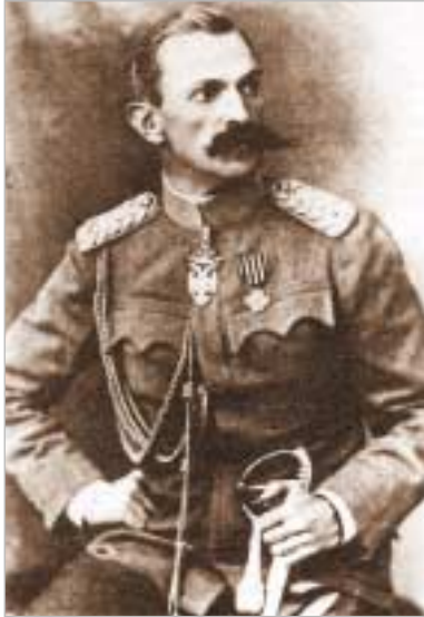
General Maister, the 1st Slovenian general ever, headed his volunteers liberating the town of Maribor.

Finally, in 1920 Slovenian regiments were disbanded or made Serbian, and Slovenian men had to serve in the army far from home, they were mostly sent to the southernmost parts of the kingdom. The circumstances there was intolerable, especially in Macedonia, Kosovo and Bosnia or Herzegovina; there the Serbian language was the only official one.