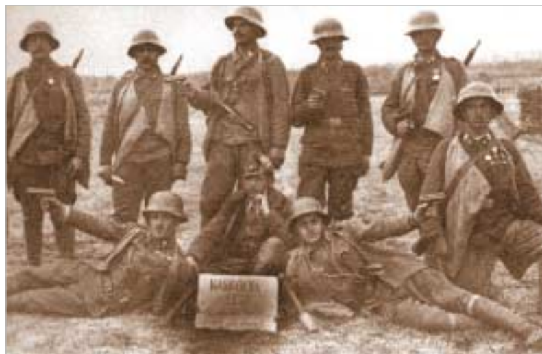
Assault troop of the 2nd Mountain Riflemen Battalion – all of them Slovenians, members of the Austro-Hungarian Army during World War I.

The Slovenian army was not in favour of the affiliation with the Kingdom of Serbia. So in January 1919 there broke out the first armed rebellion against Serbians in Ljubljana. Another, much greater rebellion followed in Maribor on July 22, 1919, as well as in Carinthia. Many Slovenian rebels were killed in action, and two of them were shot afterwards.