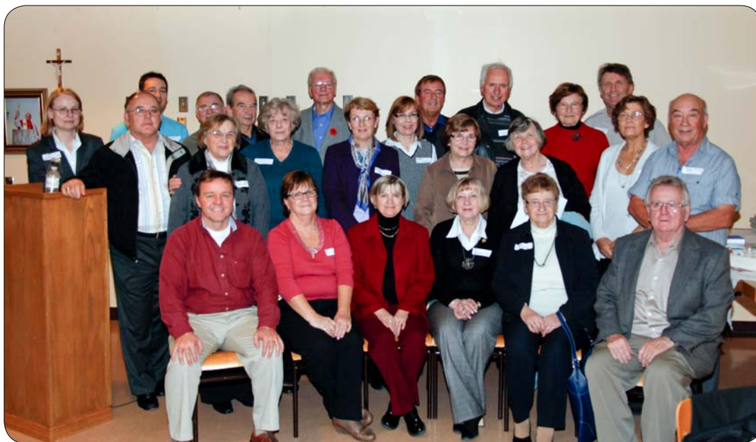
Skupinska slika udeležencev na konferenci “Pridružite se nam”